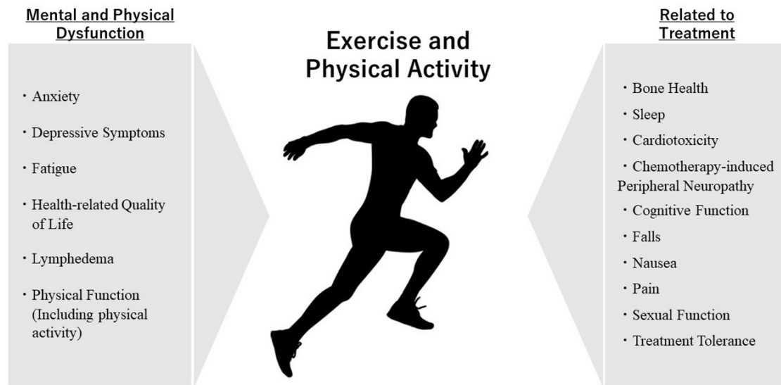
Fig. 2. Benefits associated with exercise for cancer survivors