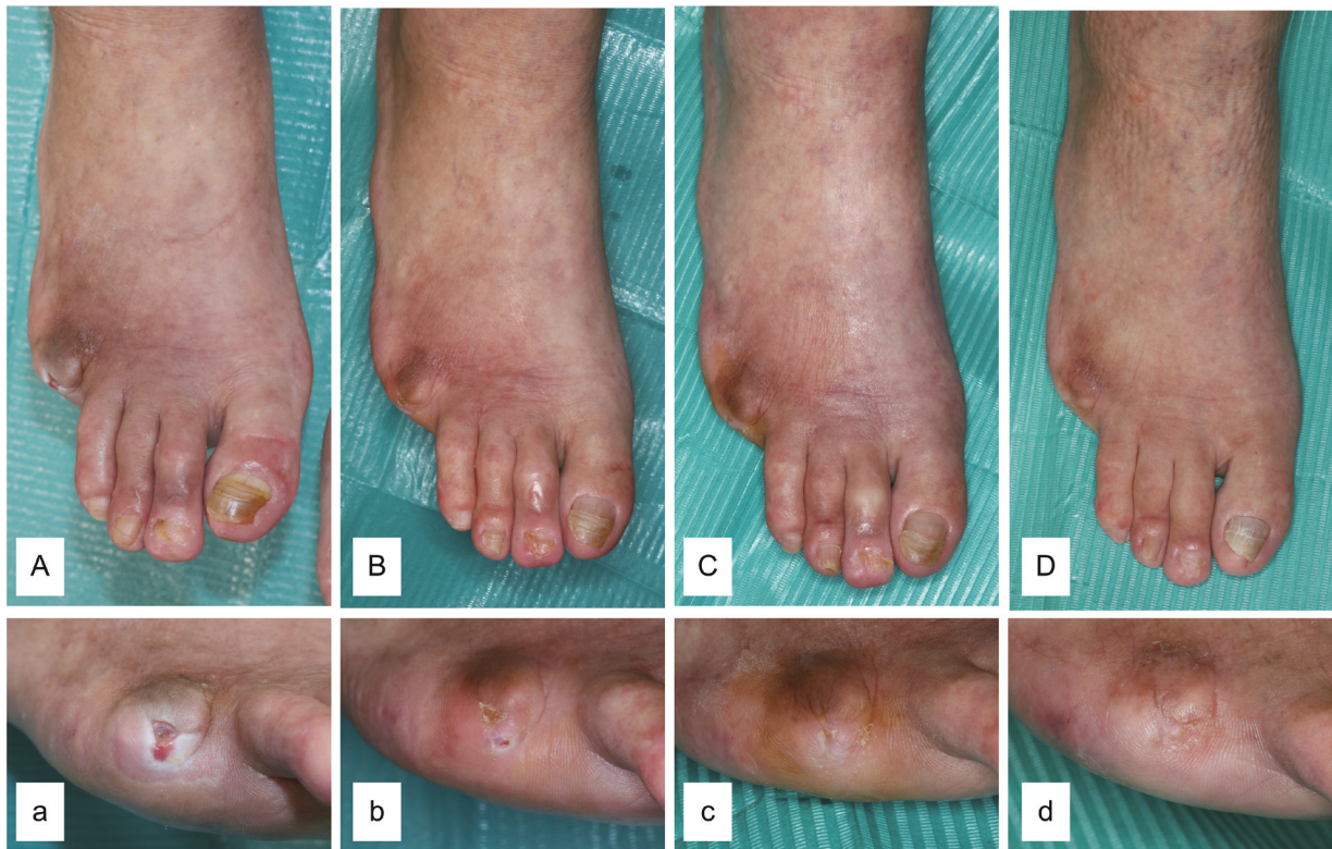
Fig. 4. Healing process of the right foot ulcer post-spinal cord stimulation.

A, a: 1 month, B, b: 3 months, C, c: 6 months, D, d: 12 months. The necrotic tissue gradually decreased, and tissue granulation gradually increased. There was no ulcer, and the color of the foot improved 12 months post-operation.