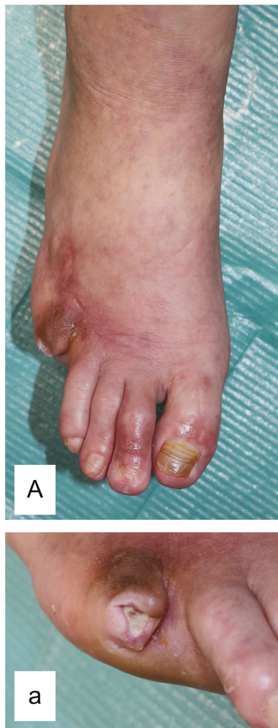
Fig. 1. The right foot ulcer prior to spinal cord stimulation.

The SCS trial was performed under local anesthesia. Since decreased microcirculation was observed in both lower limbs, we planned to introduce two electrodes into the epidural space where paresthesia could be induced in both lower limbs. Bilateral spinal cord stimulator leads (Vectoris Sure Scan MRI compact; Medtronic, Minneapolis, MN, USA) were placed in the posterior epidural space at the T10/11 level where the paresthesia of both lower limbs could be confirmed by intraoperative stimulation (Fig. 3). During the trial, the patient noticed a marked improvement in pain and an improvement in the color and temperature of both lower limbs. Therefore, an implantable pulse generator (IPG, Intellis; Medtronic) was placed 1 week after the