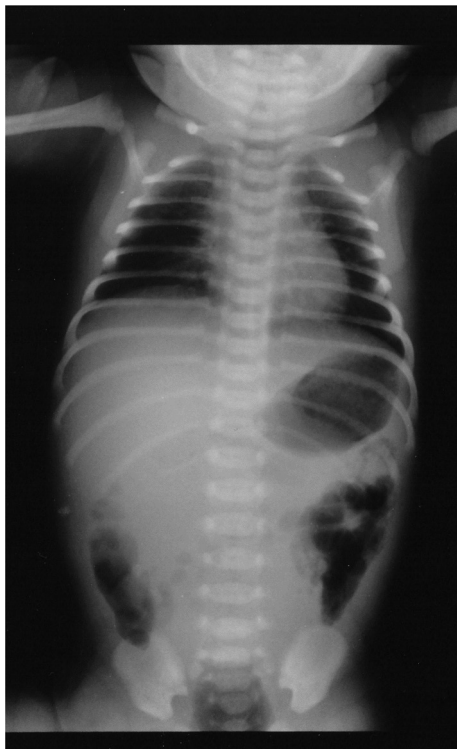
Fig. 2. Plain radiograph of the chest and abdomen on admission at 2 hours after birth. The radiograph revealed a homogeneous mass in the mid-abdomen pushing the bowel gasses to the bilateral sides.