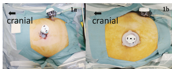
Fig. 1. Trocar arrangement of the multiple trocar technique (a). Trocar arrangement of the EZ access technique (b).