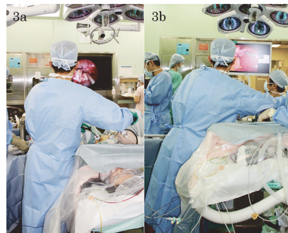
Fig. 3. Posture of surgeon in 2-port laparoscopic surgery (a). Posture of surgeon in conventional multiport surgery (b). Surgeons can perform surgery in a more upright stance in 2-port laparoscopic surgery, and feel less fatigue during long surgery (a, b).

A disadvantage of 2-port laparoscopic surgery is that because of a 2.5 cm incision in the umbilicus, attention must be paid to postoperative aesthetic appearance, particularly in patients with a shallow umbilicus. In addition, interference between the scope