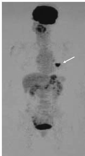
Fig. 2. Positron emission tomography image shows intense uptake of [ ^{18}\text{F} ]fluorodeoxy-D-glucose in the left lung tumor, but no uptake in the right lung tumor ( arrow ).

tion. The intraoperative pathological diagnosis by frozen section was hamartoma. The patient then underwent left lower lobectomy with ND2a mediastinal lymph node dissection under VATS in the right decubitus position. The reason that she underwent left lower lobectomy and lymph node dissection rather than partial resection was the size (diameter > 3 cm) of the tumor. The operating time was 220 minutes, and the total blood loss was 50 g. The pathological diagnosis of the right lung tumor was chondromatous hamartoma (Fig. 3, A, B), and the left lung tumor was a moderately-differentiated tu-