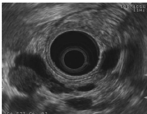
Fig. 5. Typical image of IPMN obtained by ER-ES.

Scores of six independent evaluators were : 4, 4, 5, 5, 4, and 5 for absence of artifacts caused by multiple ring echoes ; 4, 5, 5, 5, 5, and 5 for visibility of all lesions ; 4, 5, 5, 4, 4, and 5 for absence of artifacts in dilated branched pancreatic duct.