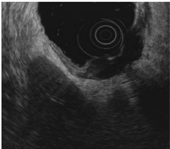
Fig. 2. Typical image of advanced gastric cancer obtained by MR-ES.

Scores of six independent evaluators were : 5, 5, 4, 5, 5, and 5 for absence of artifacts caused by multiple ring echoes ; 5, 5, 5, 5, 5, and 5 for visibility of tumor echo ; 5, 5, 5, 5, 5, and 5 for visibility of deepest part of tumor ; 5, 5, 5, 4, 4, and 5 for visibility of whole echo of tumor and its surrounding organs.