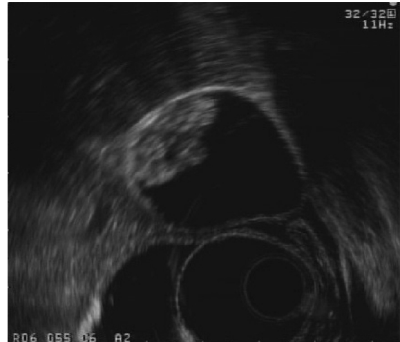
Fig. 3. Typical image of gallbladder lesion (gallstone) obtained by ER-ES.

We chose gastric cancer, gallbladder lesions, and branch-duct type IPMN for this study for the following reasons. EUS-FNA, for which the L-ES is required, is now widely used to diagnose digestive diseases and others ; however, diagnosis based on EUS morphology is more important than diagnosis