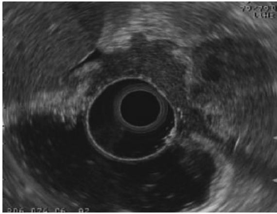
Fig. 1. Typical image of advanced gastric cancer obtained by ER-ES.

Scores of six independent evaluators were : 5, 5, 4, 5, 5, and 5 for absence of artifacts caused by multiple ring echoes ; 5, 5, 5, 5, 5, and 5 for visibility of tumor echo ; 5, 5, 5, 5, 5, and 5 for visibility of deepest part of tumor ; 5, 5, 5, 4, 4, and 5 for visibility of whole echo of tumor and its surrounding organs.