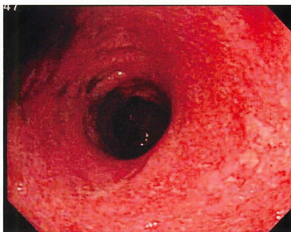
Fig. 1. Sigmoidoscopy showed consecutive abrupt mucosa, spontaneous bleeding and multiple deep ulcers.

A 77-year-old woman had experienced lower abdominal pain and diarrhea since January, 2003. In February, she had a diagnosis of UC and received prednisolone for three months, but the colitis was refractory to the therapy. She was referred to our hospital in May. On admission, she suffered from lower abdominal pain. She had bloody stool or diarrhea 5 times a day. On physical examination, her body temperature was 37.0°C, her heart beat was 80/min, and blood pressure was 110/80 mmHg. Her bowel sounds were weak. She had tenderness in the left lower quadrant of abdomen. Hematological examination showed anemia, red blood cell count of 311 \times 10^4/\mu\text{l} and hemoglobin of 9.0 g/dl, and normal white blood cell count of 5,100/\mu\text{l} . The level of C-reactive protein was 1.3 mg/dl, and erythrocyte sedimentation rate was 52 mm in 1 hour. The levels of total protein and serum albumin were 5.6 g/dl, 2.4 g/dl, respectively. Disease activity of UC was moderate according to the Truelove and Witt's criteria, which classified by the extent of bloody stool, fever, pulsation, anemia, repeat of defecation, and a high erythrocyte sedimentation rate 5 . Sigmoidoscopy showed abrupt mucosa, pseudopolypoidosis, and consecutive multiple deep ulcers from the rectum to sigmoid colon (Fig. 1). Biopsied specimen