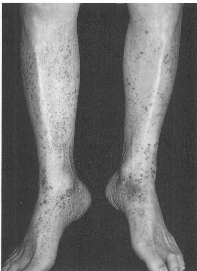
Fig. 3. Purpura on the lower limbs appearing on the 75th hospital day. The purpura was manifested sporadically on each of the lower limbs.

biliary pancreatitis was denied. We diagnosed the relapse of acute pancreatitis and infection of the pseudocyst. We administered many kinds of antibiotics (imipenem/cilastatin, panipenem/betamipron, piperacillin, ciprofloxacin), gabexate mesilate (2,000 mg/day), urinastatin ( 30 \times 10^4 U/day), and octreotide acetate (150 \mu g/day). These treatments improved the severe symptoms and status. By the 71st hospital day, the inflammatory response decreased to CRP 0.7 mg/dl, WBC 6,000/ \mu l; the pancreatic enzymes were normalized. Nevertheless, colicky pain in the upper abdomen continued. On the 75th hospital day, purpura appeared on the lower limbs, subsequently spreading to the trunk and extremities (Fig. 3). The patient also complained of ankle joint pain and mild melena. Laboratory data showed a WBC count of 5,200/ \mu l, red blood cell (RBC) count of 290 \times 10^4 / \mu l (normal value: 416\text{--}558 \times 10^4 / \mu l), hemoglobin of 10.1 g/dl (normal value: 13.2–16.8 g/dl), and a platelet count of 16.7 \times 10^4 / \mu l (normal value: 14.7\text{--}34.1 \times 10^4 / \mu l). The eosinophil count was not elevated (2% of WBC). In coagulation, the partial thrombin time was normal, but prolonged activated partial thromboplastin time (41.8 s,