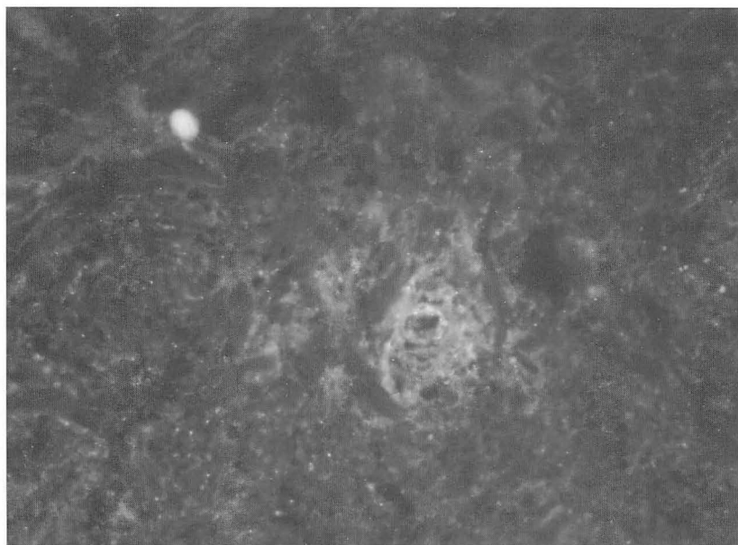
Fig. 5. IgA stain of the biopsied specimen. Immunofluorescence microscopy showed IgA deposition in a small vessel of the dermis ( \times 400 ).