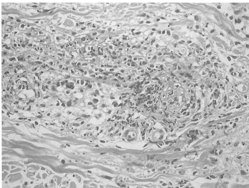
Fig. 4. Biopsied specimen of purpuric skin rash. In the dermis, prominent infiltration of neutrophils was identified around small vessels; vascular fibrinoid degeneration was also apparent. These findings suggested HSP (H&E stain, \times 400 ).