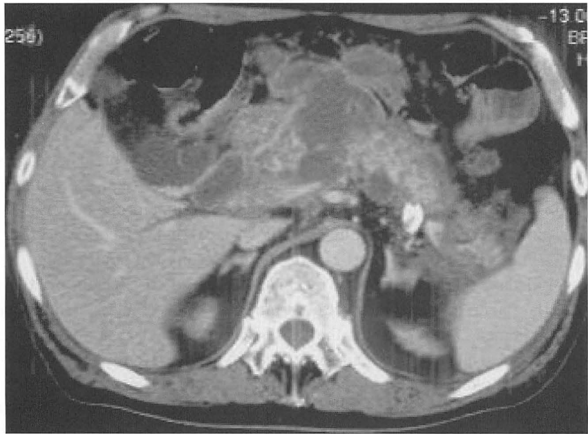
Fig. 2. Abdominal enhanced CT on day 21 showed swollen pancreas, fluid collection, and a pseudocyst. It was inferred to be severe inflammation because pancreatitis involved organs around the pancreas.