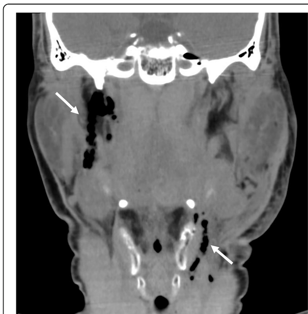
Fig. 1 Computed tomography scan showing air in the regions of the left mandible and right styloid process of the temporal bone (white arrows), suggesting a penetrating neck injury extending to the skull base

revealed anemia (hemoglobin, 9.5 g/dl; hematocrit, 28.5%) and prolonged prothrombin time (percentage of standard value, 60.2%).